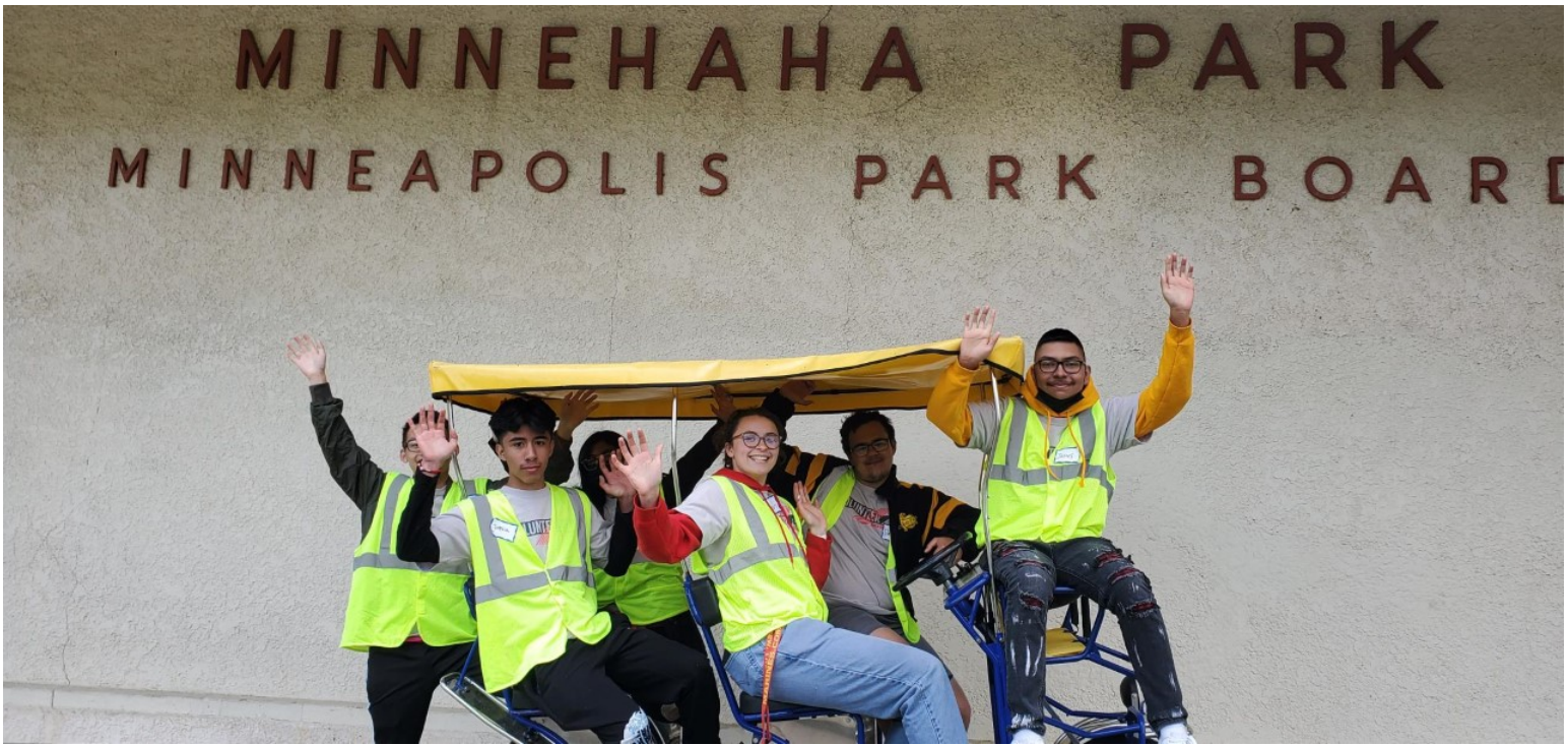
A group of unselfish CPSHS MCJROTC cadets volunteer at the Minnehaha Park Twin City Women's Race Saturday morning. They also manage to bribe the park's bike rental manager with cookies and get multiple bike rides around the park. Ooh Rah.